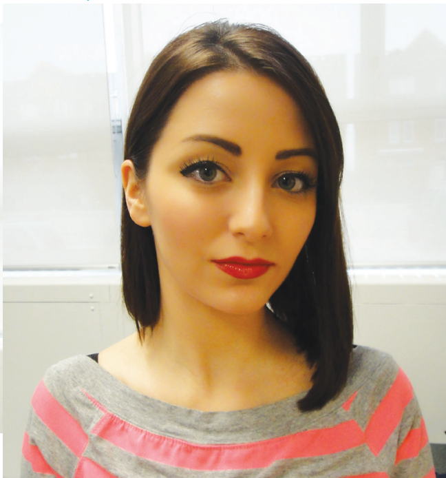
4. Line the lips with a red liner, then apply a sultry red lipstick. Add a clear or slightly tinted gloss to brighten and moisterize.